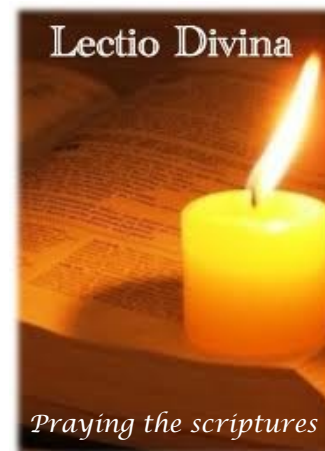
Praying the scriptures